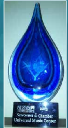
Best Newcomer Business of the Year award

Programming is made available to the underserved through the establishment of a UMC financial aid program. Additional programs are further serving the community. These programs include a Healing Rhythm Drum Circle benefiting people with disabilities, assisted living, memory care and senior facilities. UMC's Complete Concert Creation course includes not only musicians but all students who wish to be a part of the show! The course teaches all aspects of producing a live performance and culminates in a student-produced live show. This course is currently being taught in the alternative high school located at the Anderson Center in Red Wing MN.